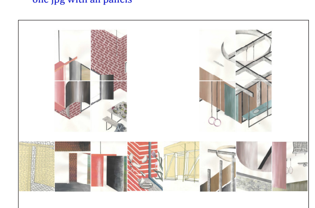
2017 HS M1 IS Micanovic Andrea Moser David composition.jpg

A) composition of the whole presentation: one jpg with all panels